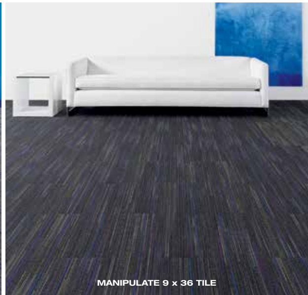
MANIPULATE 9 x 36 TILE