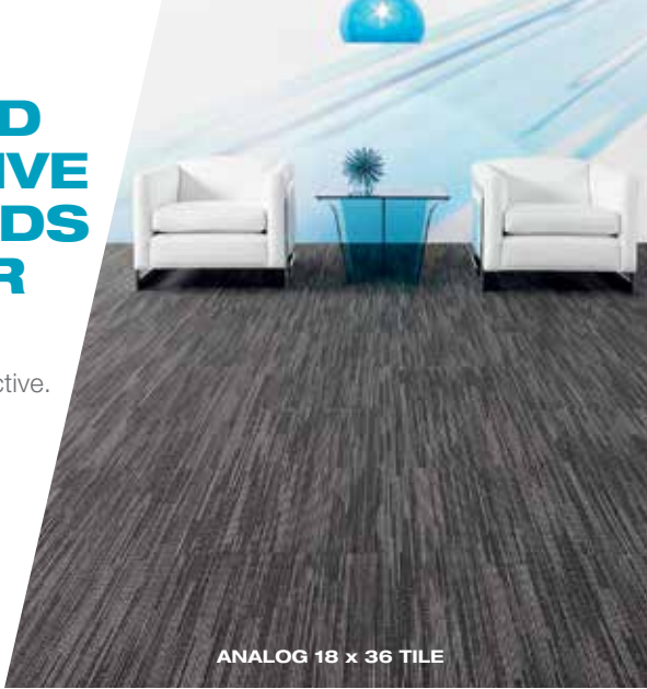
ANALOG 18 x 36 TILE

Welcome to an altered perspective. We've changed the space and redefined the room to give you an entirely different point of view—one where things aren't quite what they seem. Layer your curiosity with creativity to blur the line between what's real and what's surreal. This is Altered, a collection where manipulation takes left, right, and center stage—redefining how we see. Not just within your space, but all that surrounds it. DESIGN IS DISCOVERED