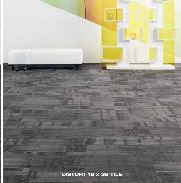
DISTORT 18 x 36 TILE