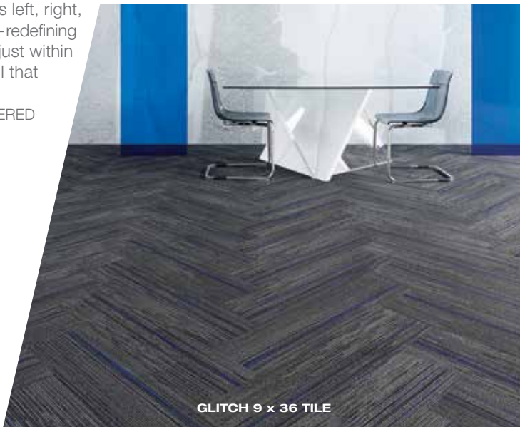
GLITCH 9 x 36 TILE