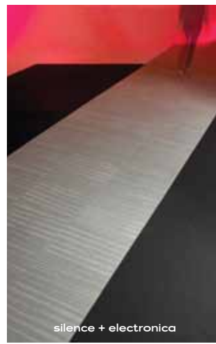
silence + electronica