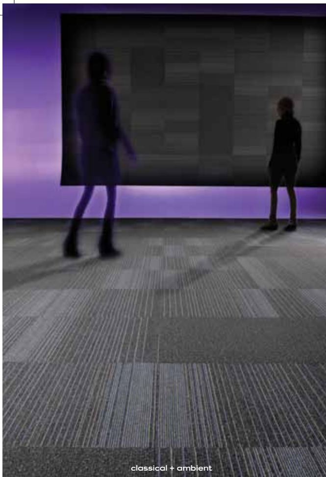
classical + ambient