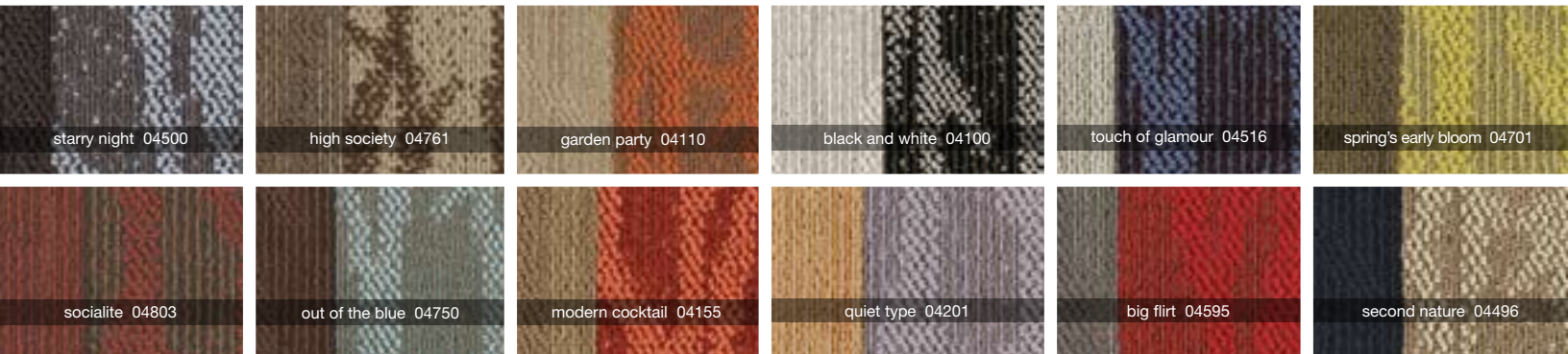
starry night 04500