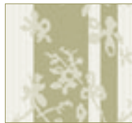
vivid bloom | 59504