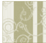
vivid swirl | 59505