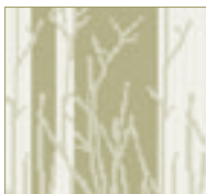
vivid shadow | 59506